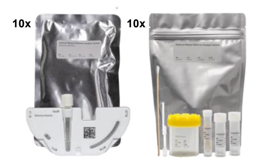
Figure 1: Picture of the Detection Module (left) and Concentration Module (right) of the Food & Beverage Kit, Type Spoilage Bacteria Ident v2.